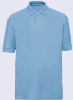
Optional branding on this item