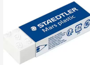
Eraser & Sharpener