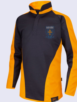
Optional branding on these items